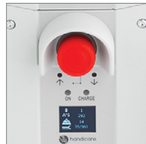
New control box with lift counter and overload indicator.