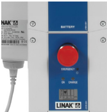
New control box with diagnostics, e.g. lift counter and overload indicator.