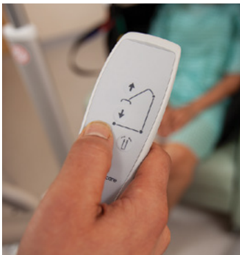
Ergonomic and easy-to-use hand control with 4 buttons.

Eva450EE is delivered with a standard carry bar length of 17 in (450 mm), which is suitable for most users and lifting situations.