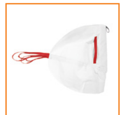
ThoraxSling With Seat Support, Disposable, Non-Woven