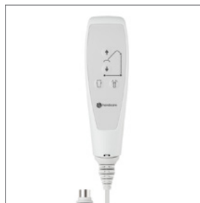
Ergonomic and easy to use hand control with 2 (EM) or 4 (EE) buttons.