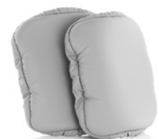
Padding for leg support