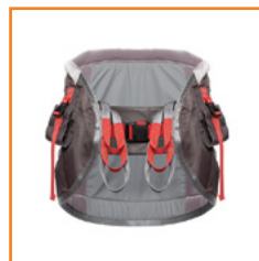
ThoraxSling With Seat Support, Polyester