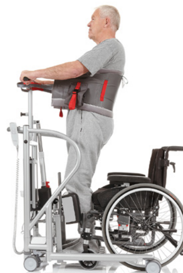
Active sit-to-stand with natural movement pattern.