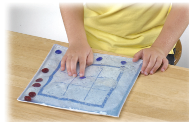
Tic-Tac-Toe Gel Pad

User moves plastic disks through gel waves