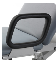
5112: Drop Down Armrests