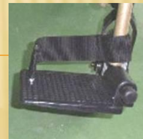
Heel Loop ( pr ) $100