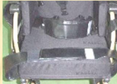
Hip Belt $120 Thigh Belt $120