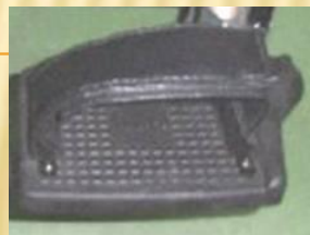
Thenar Belt ( pr ) $100