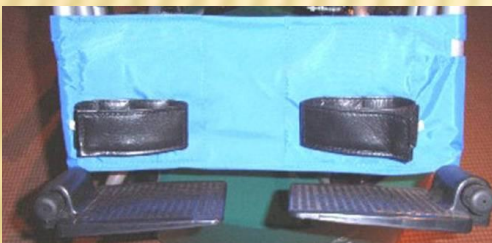
Shank Loop ( pr ) $120