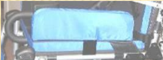
Side Pad (pr) $220