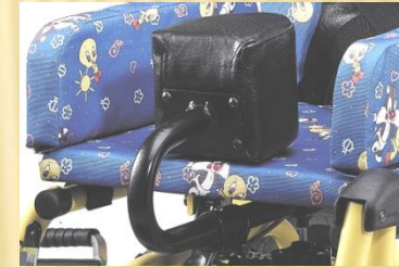
Adjustable Pommel $120