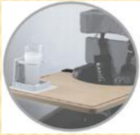
Dining Tray $75