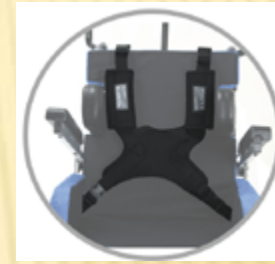
Safety Belt $120