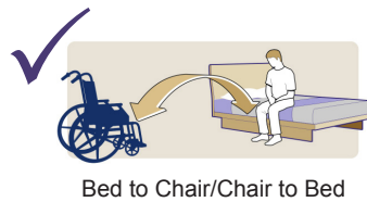
Bed to Chair/Chair to Bed