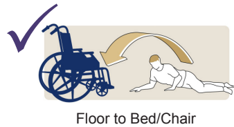
Floor to Bed/Chair