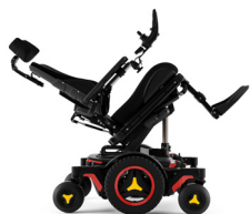
Posterior tilt adjustment