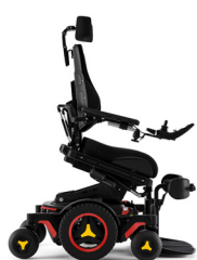
Anterior tilt adjustment