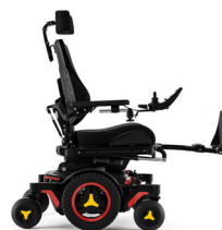
Leg rest adjustment