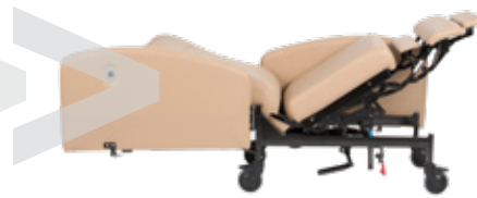
Secure-Glide™ for stress-free positioning

Exclusive to Verō , Winco introduces "Secure-Glide™" Trendelenburg control. Secure-Glide™ provides gentle patient positioning while preventing clinician strain. The controlled descent helps eliminate any need, or natural reflex, to strain to control the rapid patient positioning in emergency situations.