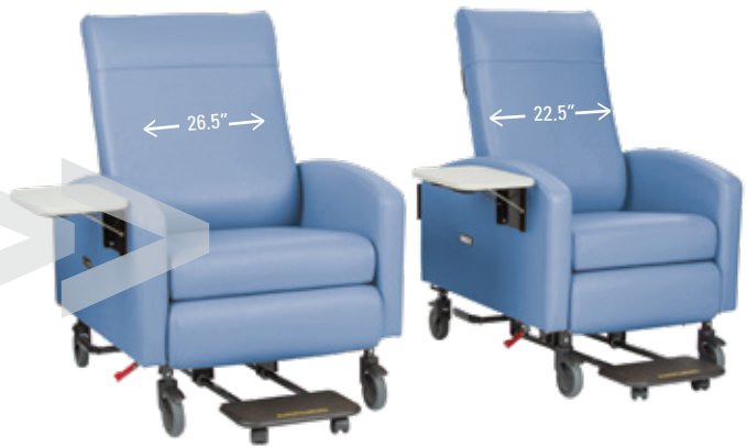
X-Large 500 lb Capacity