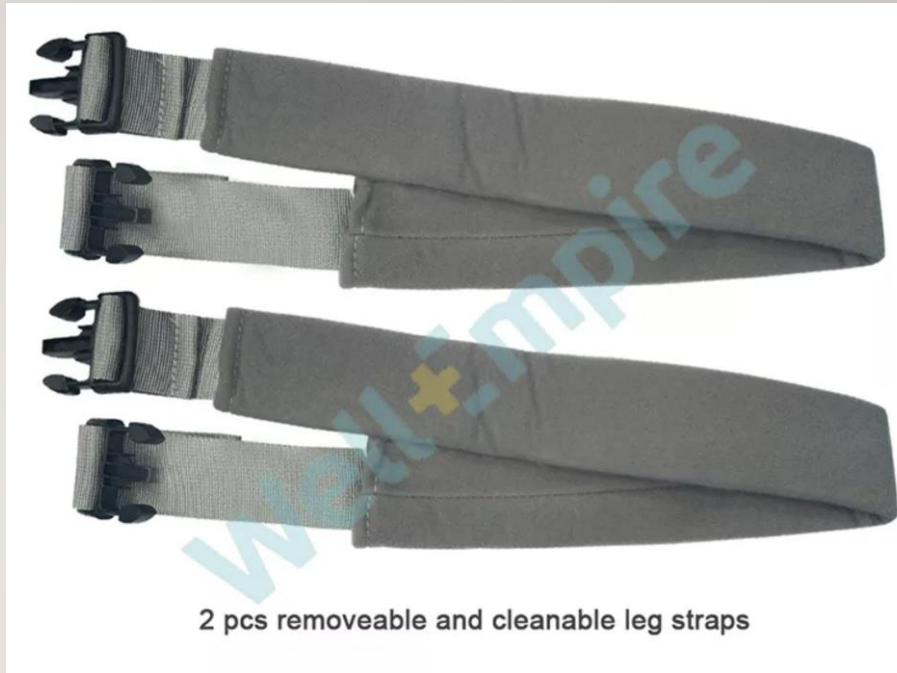
2 pcs removeable and cleanable leg straps