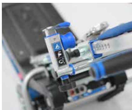
Adjustable backrest clamp