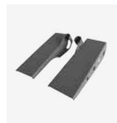
Ramp PTR Art. No. 975 103