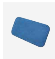
Backrest cushion PTR Art. No. 975 104