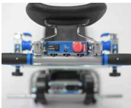
Control panel handle unit