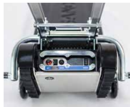
Control panel base unit