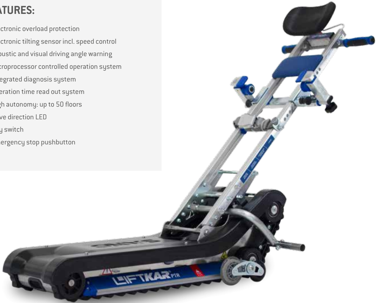
Machine including options and foldable wheelchair-support.

The LIFTKAR PTR is a mobile unit that has been especially developed for operating on straight steps. Wheelchair users can now move around more freely and helps no longer need to strain their backs on the stairs.