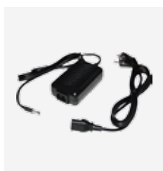
Charger PTR Art. No. 075 637