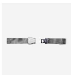
Lap belt PTR Art. No. 075 105 (fix mounted)