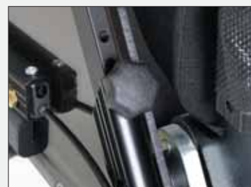
The height of the armrest is adjusted by using the handle placed under the armrest.

The configuration of the wheelchairs differs from market to market. For other accessory: See pages 22-25.