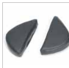
11 Comfortpads for Netti Mini