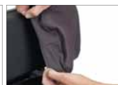
02 Removable head cover