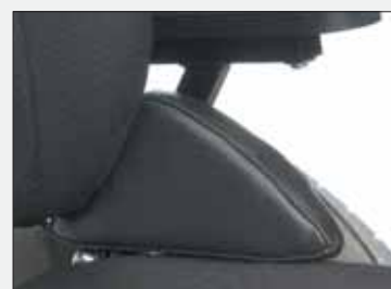
Skirt guard with upholstery (left).

The configuration of the wheelchairs differs from market to market. For other accessory: See pages 22-25.