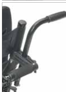
03/ 04 Driving handles (Below) come in two lengths; 30 and 50 cm.