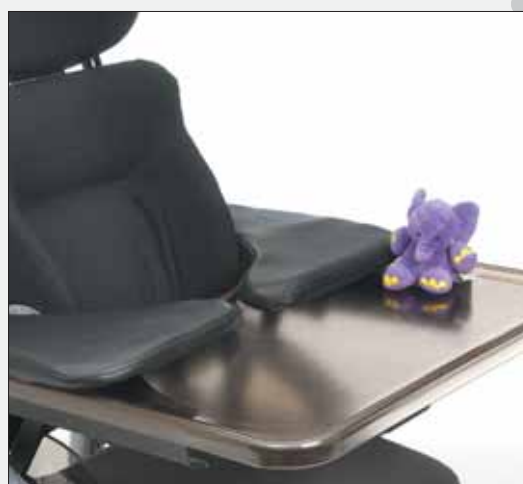
The tray can be delivered with extra upholstery.