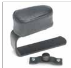
09 Abduction block mini