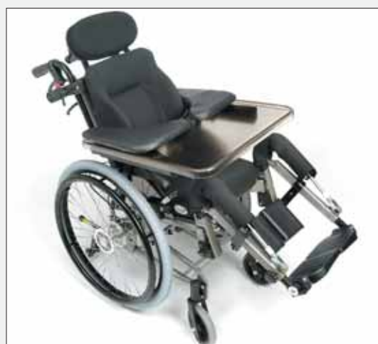
Netti Mini in resting position with tray.