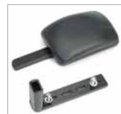
10 Adduction support This support is movable.