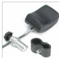
06 Side support