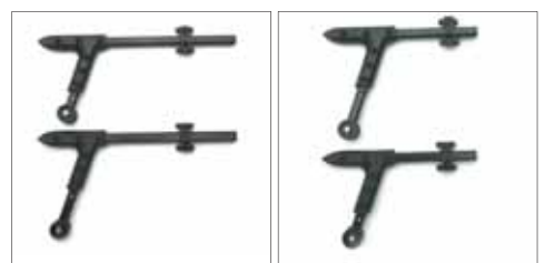
22/ 23 Anti tip To adjust the height of the anti tip wheel, remove the three screws holding the adjusting tube. All tubes are adjustable in height. The anti tip fits all wheelchair heights and depths