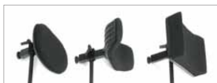
01 Netti Head support in different sizes