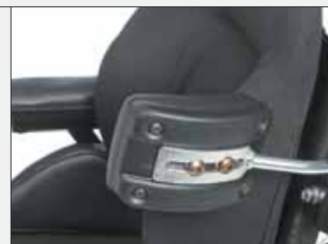
The side support which is angle adjustable and rotating is mounted on the backrest tube.