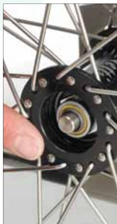
24 Quick release on main wheel

All wheels and front castors on Netti wheelchairs are attached using quick release axles allowing easy attachment and detachment of the wheels and castors.