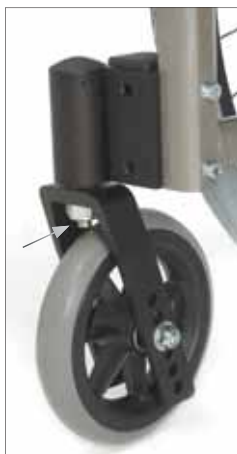
33 Quick release front castors