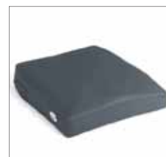
Netti Sit Mini cushion.