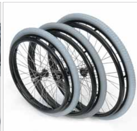
24 Different sizes of main wheel 20"-26" can be delivered with a companion brake.