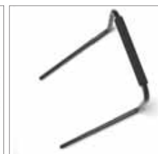
05 Push bar