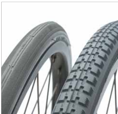
Different main wheels.