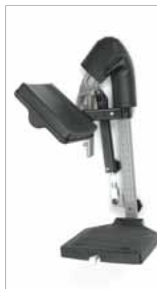
12 Foot support angle adjustable